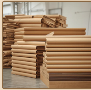
KRAFT PAPER 180 GSM