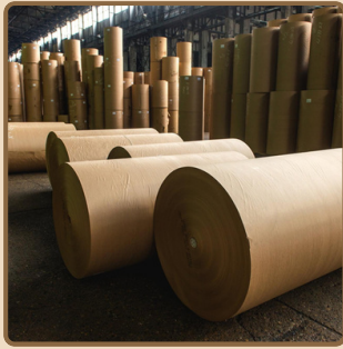
TESTLINER (TLS) 90 GSM