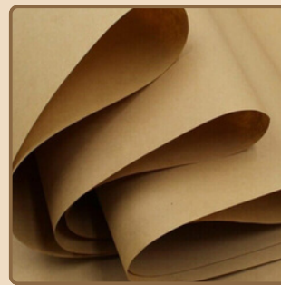
FLUTING PAPER – 125 GSM