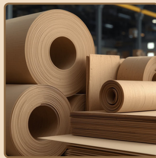
FLUTING PAPER – 112 GSM