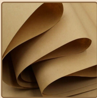
FLUTING PAPER – 90 GSM