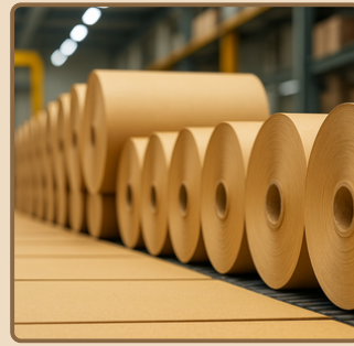
KRAFT PAPER 125 GSM